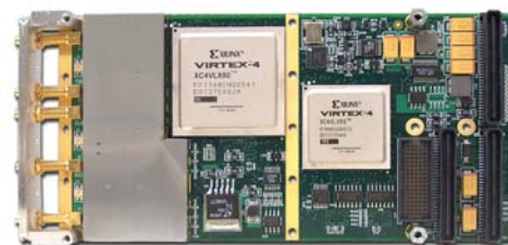
Figure 3. XMC-3321 Dual Transceiver XMC Module

The XMC-3321 supports industry standard IF frequencies including 10.7, 21.4 and 70 MHz through the use of dual 14-bit A/D converters sampling at up to 105 MSPS and dual 14-bit D/A converters sampling at up to 300 MSPS in a single-width XMC form factor. The XMC (ANSI VITA 42.0) standard is fully compatible with IEEE P1386.1 PMC standard but offers the additional benefit of dedicated high-speed links between an XMC-compliant carrier and its mezzanine modules. The XMC-3321 supports Spectrum's Solano Communication Technology via the XMC high-speed interface. The module also features a single user programmable Xilinx Virtex-4 FPGA device for wide bandwidth signal processing and filtering in the digital domain. For more information on the XMC-3321 see the XMC-3321 datasheet at www.spectrumsignal.com .