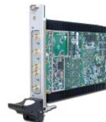
SDR-4000 Wireless Modem Lite

The SDR-4000 WML is available in either an air-cooled or conduction-cooled configuration and supports two IF input channels, two IF output channels, an internal or external 10 MHz reference and high speed sample clock, Gigabit Ethernet, RS232 and JTAG connectivity. The SDR-4000 WML employs a combination of a Xilinx Virtex-4 FPGA, a TI TMS320C6416T DSP and an MPC8541E General Purpose Processor.