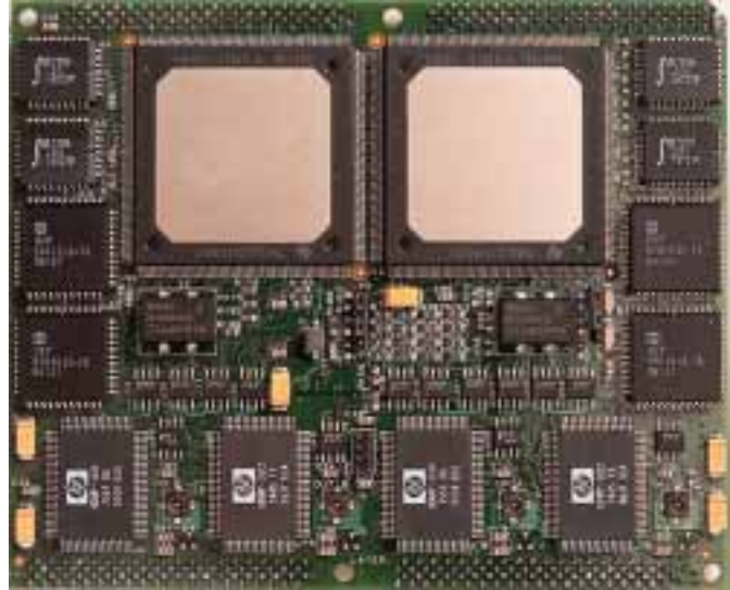
A quad digital down converter TIM-40 module (TIM-DDC).

The next module in the system accepts the digitized wideband IF from the ADC module and simultaneously tunes, downconverts and processes four narrowband channels. The down conversion module consists of a double-width TIM-40 module with four Harris HSP50016 digital down converter chips and two Texas Instruments TMS320C44 DSPs. Two DDCs are controlled by one C44 Global bus and the other two are controlled by the other C44 global bus. There are also two GLink transmitters and two GLink receivers on the module, which allow the down converter to receive and retransmit the digitized IF to other down converter modules in the system.