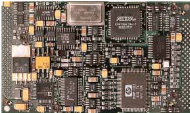
An analog input TIM-40 module (TIM-MAI)

The first module in the set digitizes a 3 kHz-to-30 MHz IF signal delivered via a 50-ohm coaxial cable. By digitizing signals closer to the antenna (either the entire 30 MHz HF band, or a 30MHz IF portion of the band of interest), a traditionally fixed function analog stage of the radio receiver, is brought under software control. Such programmable soft radio designs require not only fewer MIPS of processing power than previous technology approaches, but also provide flexible spectral, modulation and audio information in support of changing end-user needs.